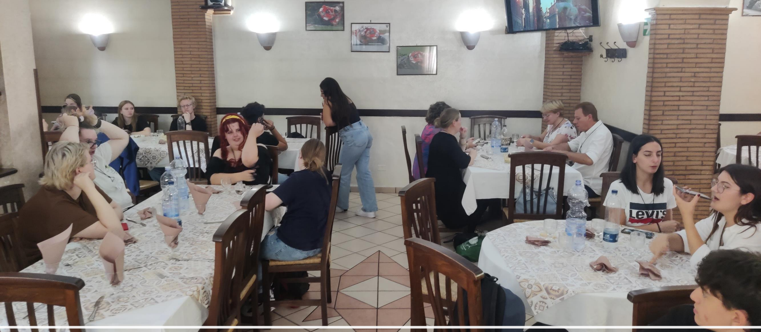
We had lunch in a restaurant near the school